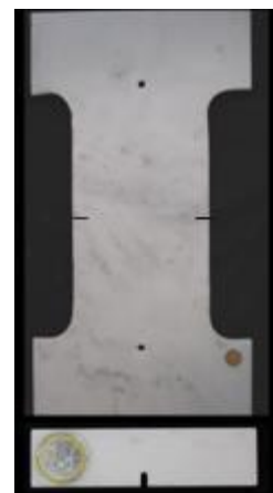
Fig.1 Typical specimens

Experimental procedure: Direct tension tests with Double Edge Notched Tensile (DENT) specimens and 3-Point Bending (3PB) tests with Single Edge Notched (SEN) specimens were carried out (Fig.1). The specimens were made either from marble or porous stone (materials used extensively for restoration projects of various cultural heritage monuments [2]). The experiments were quasi-static under displacement control mode at a rate of 0.2 mm/min. The force was measured using a 50 kN load cell calibrated with a certified compression ring of sensitivity 10.62 N. The response of the cell was linear throughout the load range of interest and the deviation did not exceed 0.3%. The displacement was calibrated using a certified micrometric calibrator. Again the response was linear and the deviation did not exceed 0.5%. The displacements around the notch-tip were measured using a novel non-contact 3D Digital Image Correlation (DIC) system by LIMESS. In addition the Notch Mouth Opening Displacement (NMOD) was measured using a suitable clip-gauge.