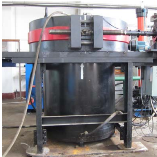
Figure 2 The appearance of the high-pressure cylinder

The experiments were performed in an improved large true tri-axial rock mechanics experiment system. Cubic model blocks of 500mm on a side were positioned in the high-pressure cylinder for simulating in-situ stress conditions. The random defects were added in the samples, and the initial artificial fracture was simulated by a thin plastic sheet. The appearance of the high-pressure cylinder, which is one of the main equipments, is shown in figure 2.