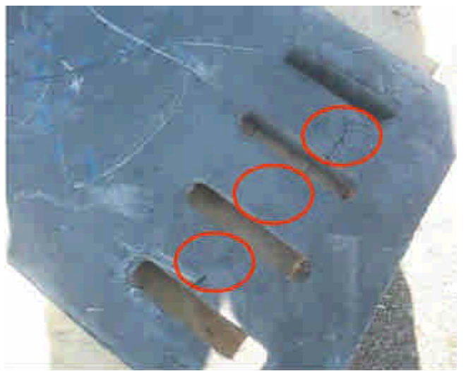
Figure 4. Photo UHPC2.5 specimen cracks after 6-meter high free falling test