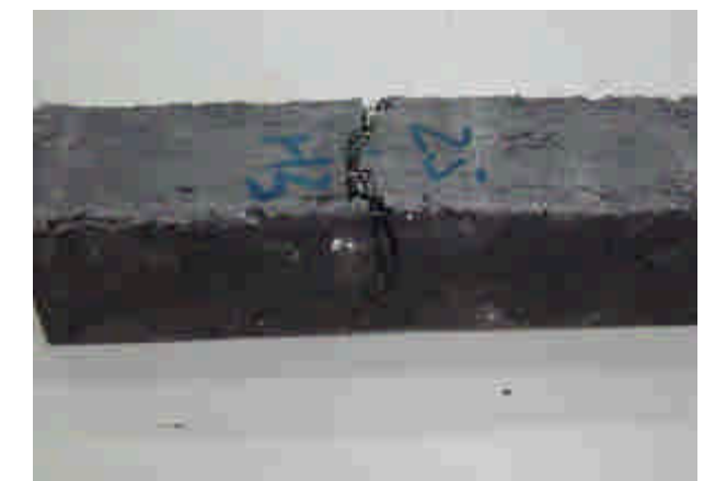
Figure 2. Photo prism UHPC2.5 after flexural test of crack extension and failure